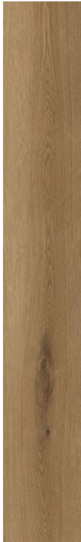
NATURAL OAK WHF00055