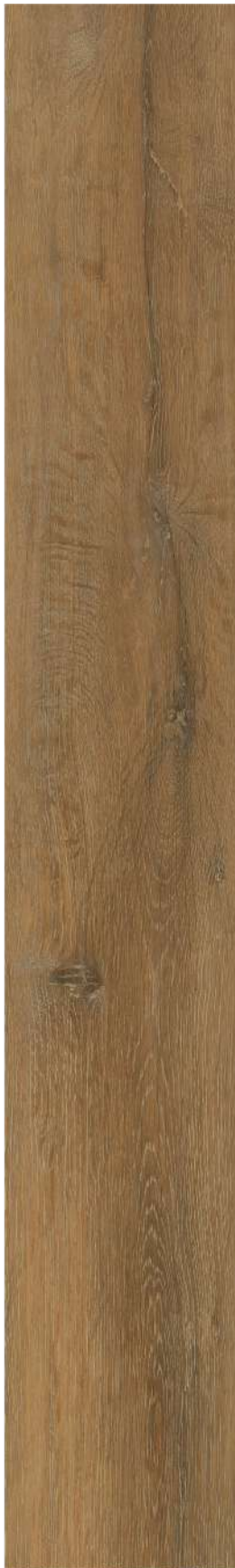
EUROPEAN WHITE OAK | WHF00120