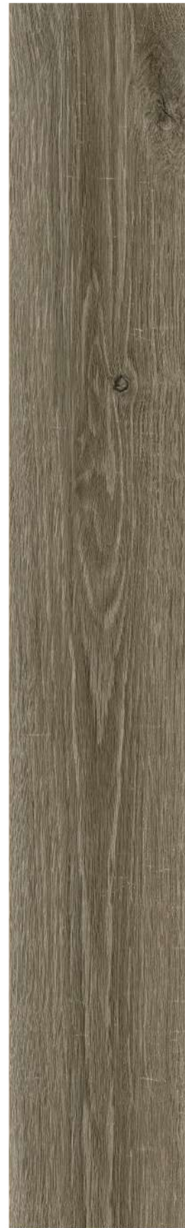
BARN DOR WHF00053