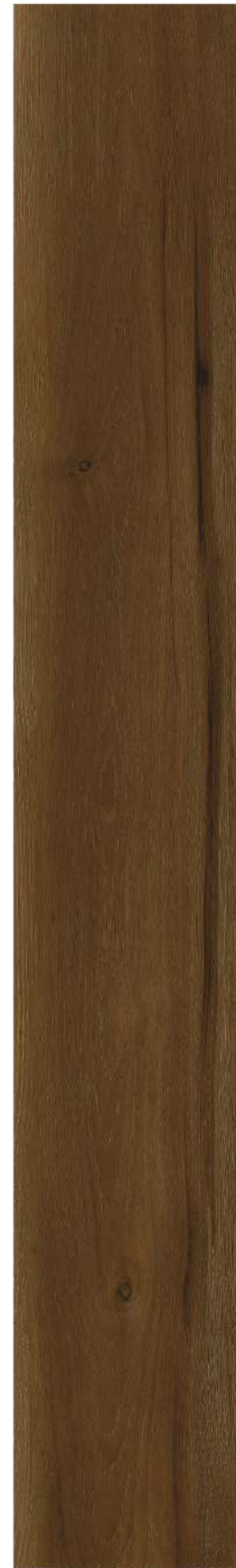
MANOR HICKORY SHF00368