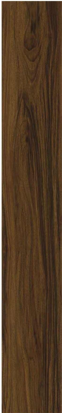
LUISIANN LAUREL SHF00148