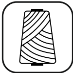
Nylon Tufted Product