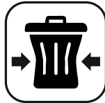
Reduces Wastage During Installation