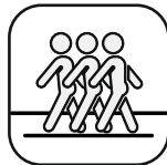
Ideal For Heavy Foot Traffic