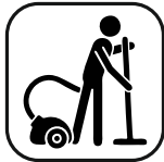
Easy To Maintain